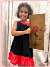
KG 2 - Parts of the plant