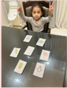
Pre KG letter 'p'