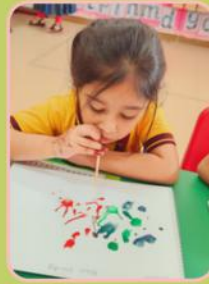
Kg1- Blow painting