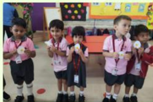
Pre KG "e" for egg