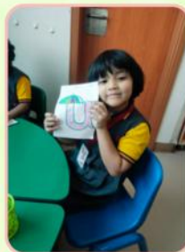
KG 1 Colorful numeric Umbrella