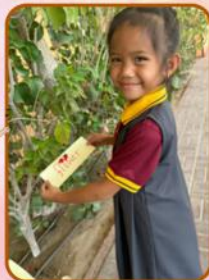
KG 2B Yhassy