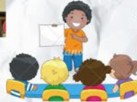
KG2 - Cartoon Character.