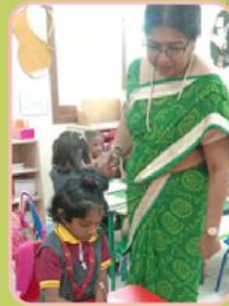
KG2 - Animal with Palm