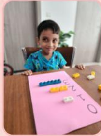
KG 1 - Number Value