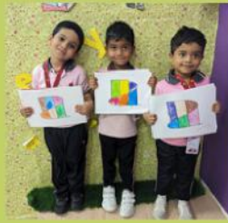
PREKG- Doodle Art.