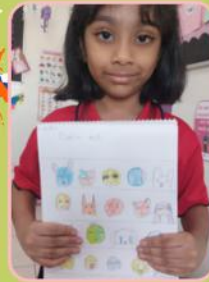
Grade 1 - Drawing and coloring Art Doodles