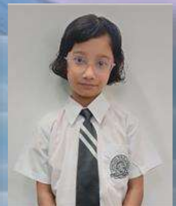
POSITION - III KRISHA 97.9%