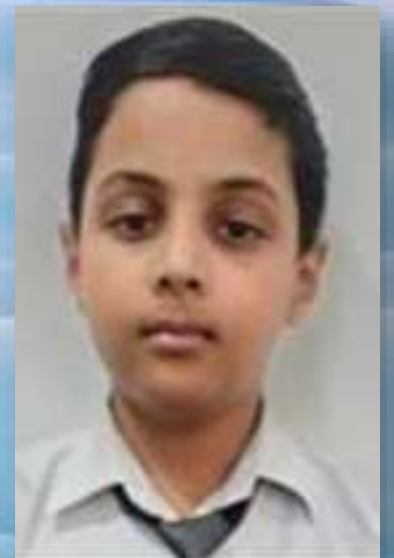
POSITION - II DARSH 96.4%