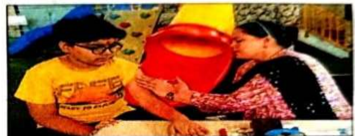
The camp, which targeted students of Classes 5-8, was held in collaboration with the district health department

The camp, which targeted the students of Classes 5-8 and aimed to increase immunity levels against illnesses like diphtheria, tetanus, and pertussis, was organized in collaboration with the district health department. The school also introduced the Robotics Lab & an English Language Lab that offers a comprehensive approach to modern education by