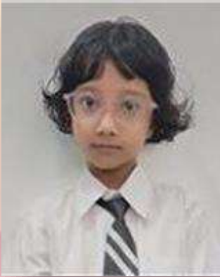
POSITION - I AARANA HARI 99.1%