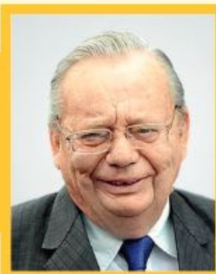
RUSKIN BOND Author

May God bless you in providing an opportunity to deliver an excellent academic and moral atmosphere for the overall growth of the children under your care.”