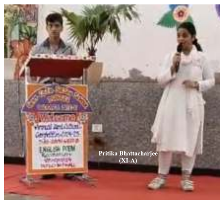
English Poem Recitation - Second Position