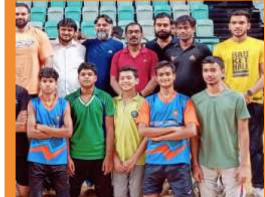
Net Ball (Jr Boys) - First Position