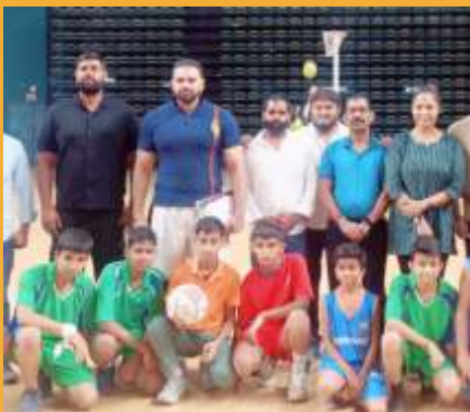
Net Ball (Sub. Jr. Boys) - First Position