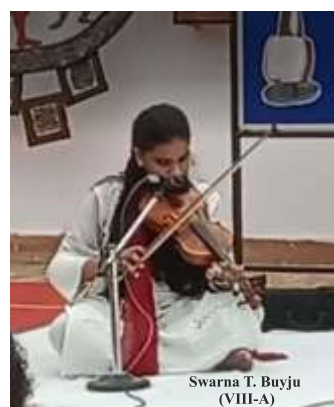
Instrumental Music (Swar) - Third Position