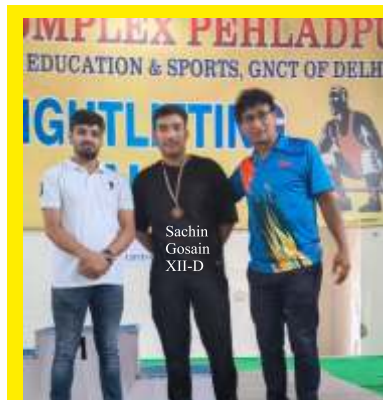
Delhi State School Games (Weight Lifting) - Second Position