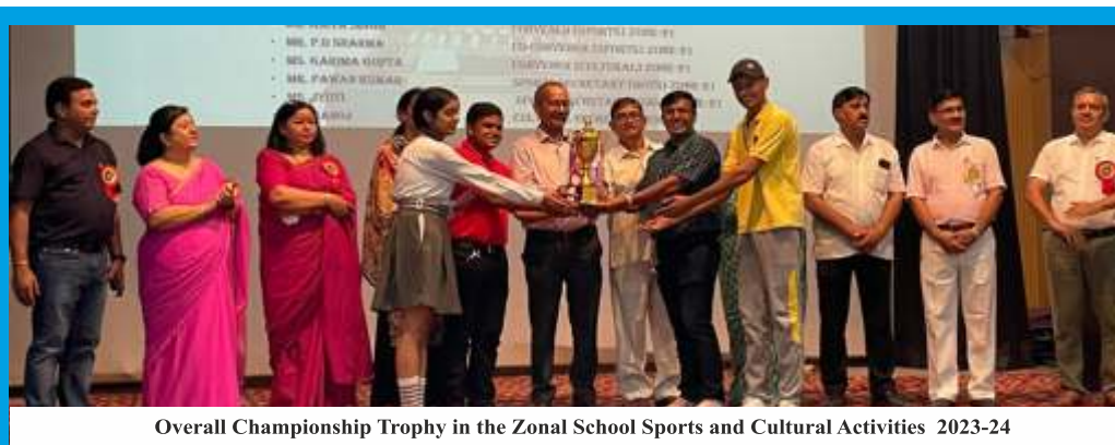
Overall Championship Trophy in the Zonal School Sports and Cultural Activities 2023-24