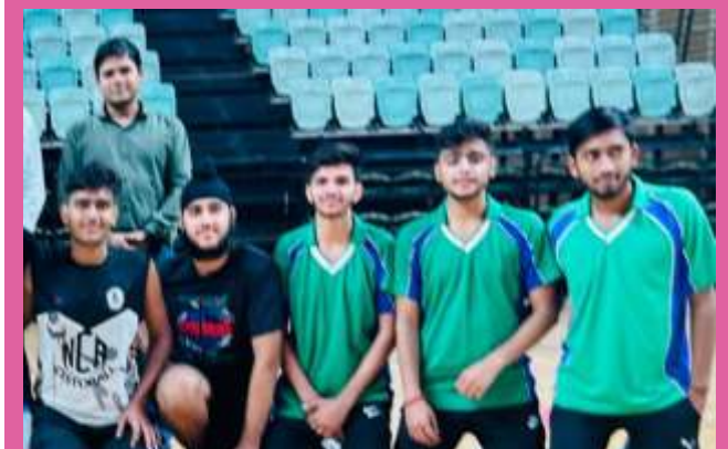
Net ball Sr. Boys - First Position