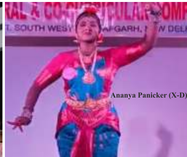
Solo Classical Dance - (Bharat Natyam) First Position