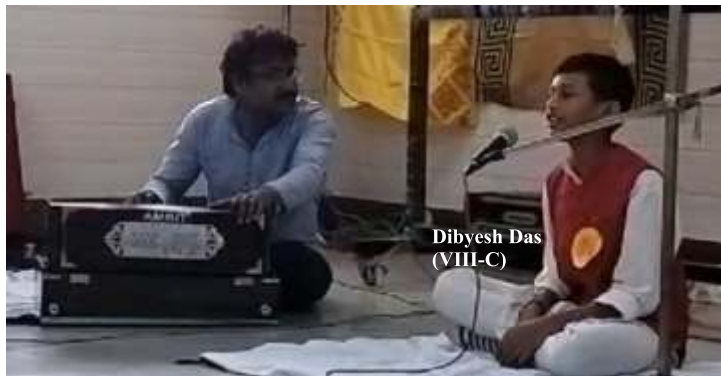
Vocal Light Music - Second Position