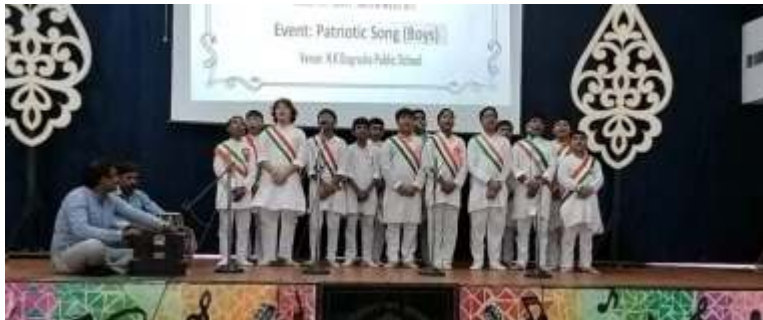
Patriotic song (Boys) - First Position