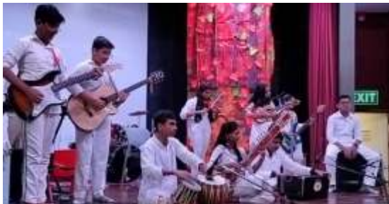
Orchestra- Third Position