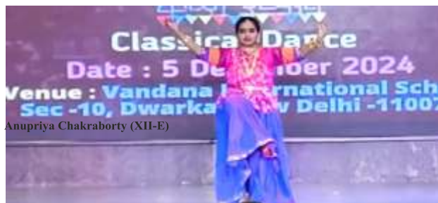
Classical Dance (Kala Utsav) - Second Position