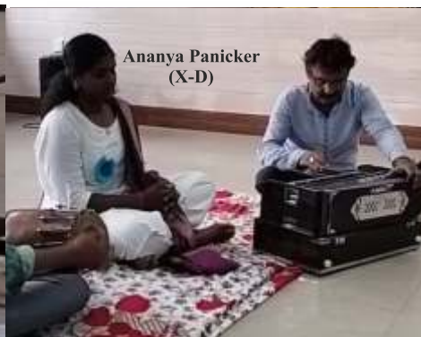
Vocal Music - Classical -Second Position