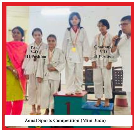
Zonal Sports Competition (Mini Judo)