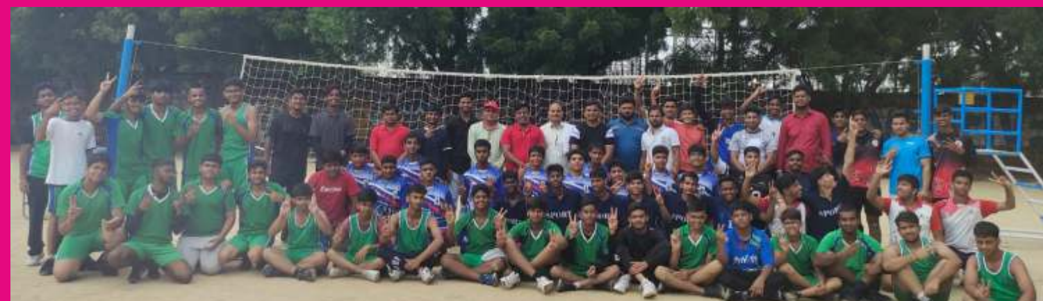
Zonal Sports Throwball Competition (Sr. Boys) - Second Position