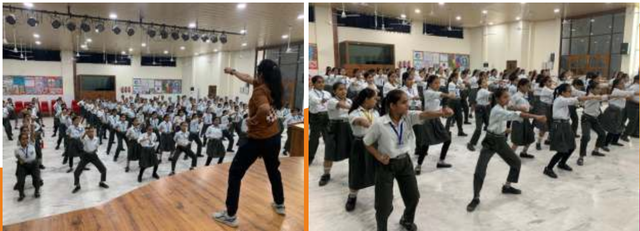
Self Defense Training and Cyber Safety Awareness Programme by Delhi Police

A vibrant learning environment continues to be fostered at Shiv Vani through a wide range of activities that engaged students beyond academics.