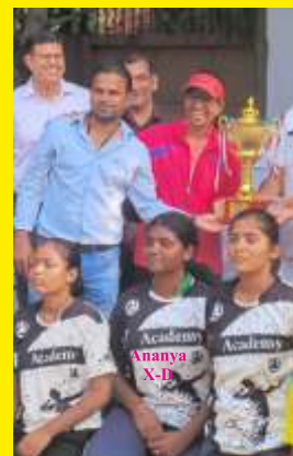
Volley Ball (U-17) - First Position