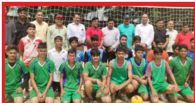
Zonal Throw ball Competition (Jr. Boys) - Second Position