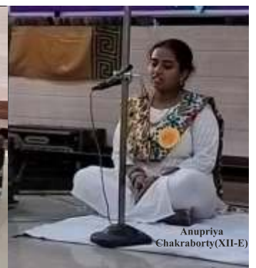
Vocal Light Music - Second Position