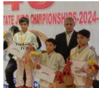
Delhi State Judo Championship - First Position