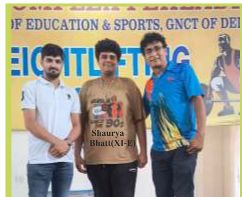
Delhi State School Games (Weight Lifting) - First Position