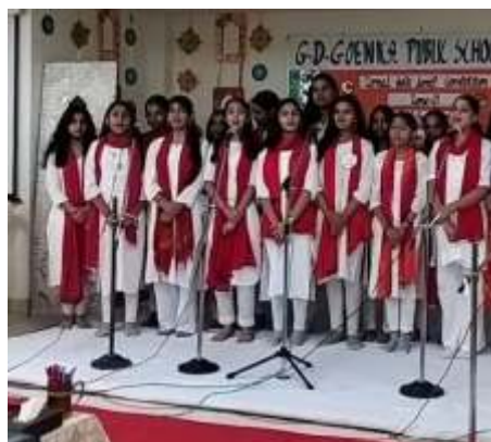
Folk Song - Second Position