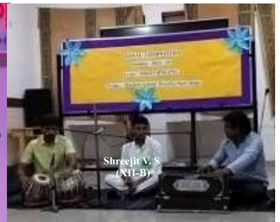
Vocal Music - (Semi Classic) Second Position