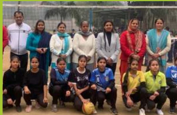
Throw ball (Sub. Jr. Girls) - Second Position