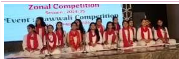
Qawwali - III Position