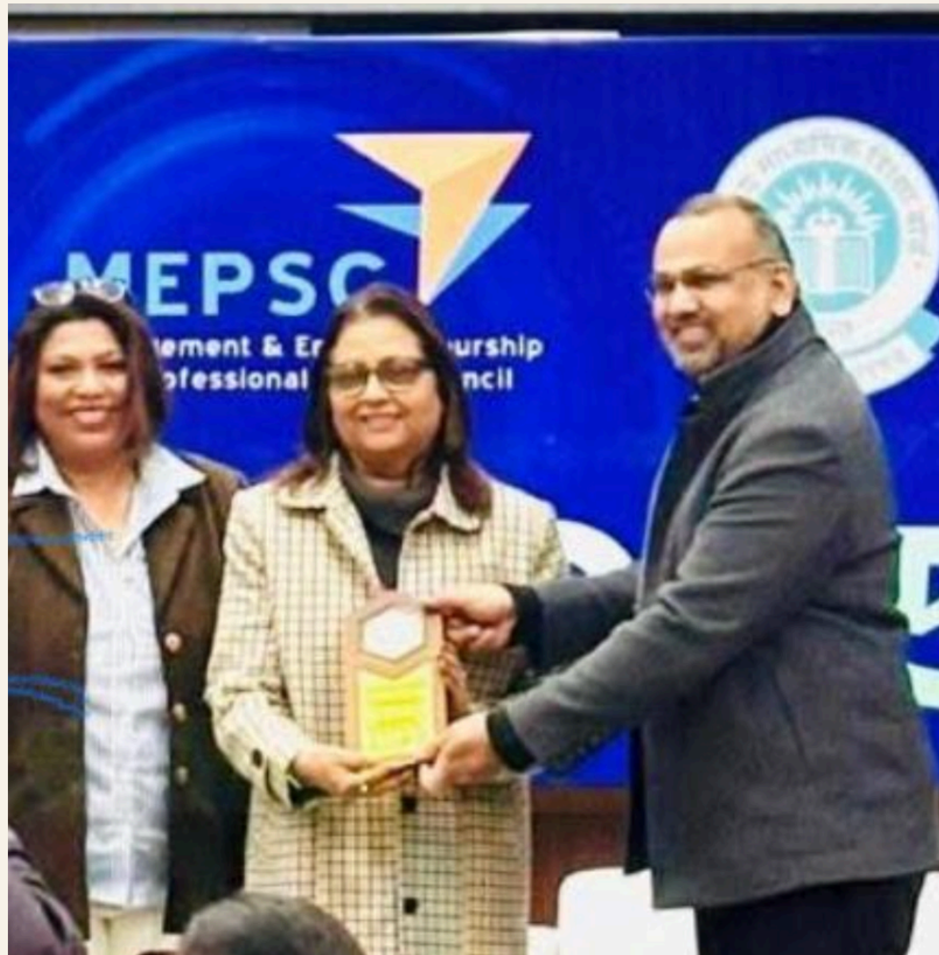
INSTITUTIONAL LEADERSHIP AWARD FOR ENTREPRENEURSHIP AT IIT DELHI

From national recognition to personal excellence, Xaverians continued to raise the bar.