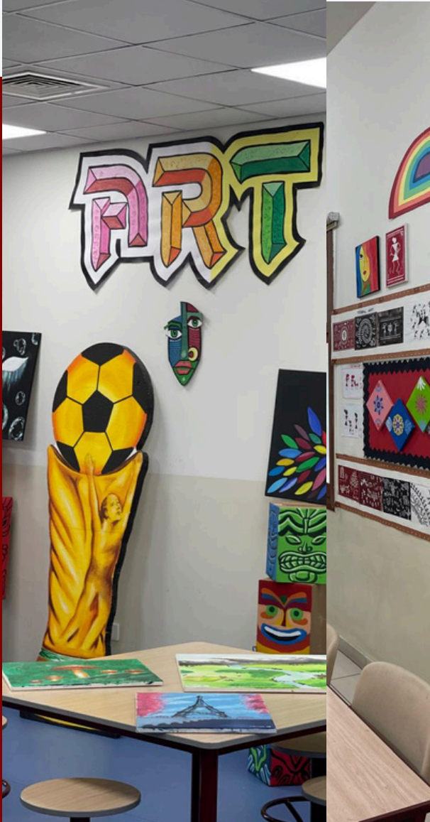
Grade 4 to 8 students