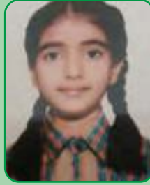
Sanvi Position - II