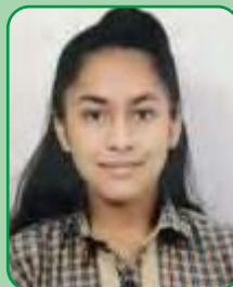
Avni Position - II