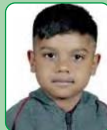
Atharv Position - III