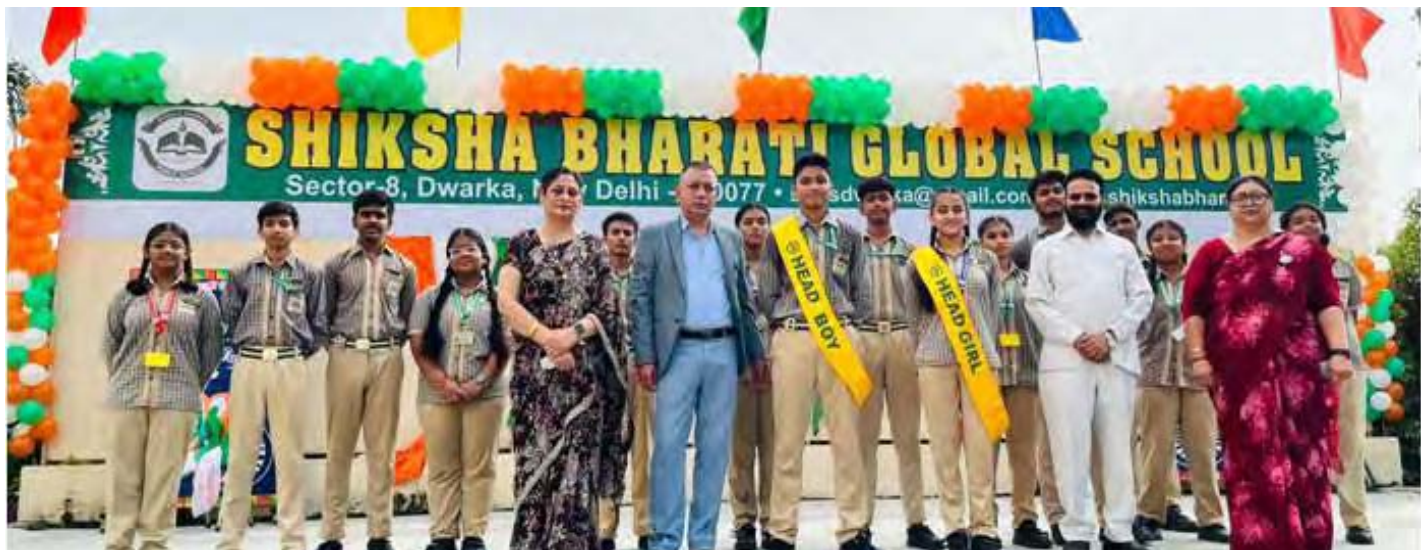
DISCIPLINE IN-CHARGES OF MIDDLE WING