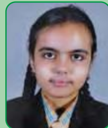
Gavva Position - III