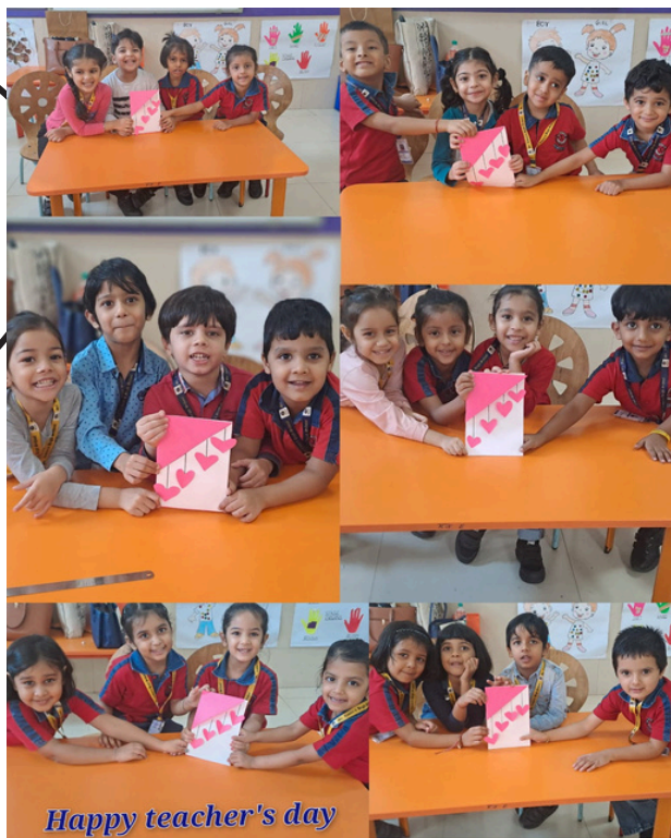
Happy teacher's day