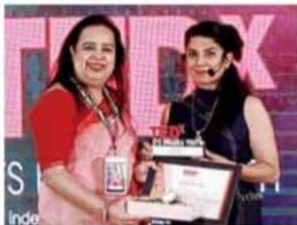
TEDx STS Dwarka Youth

In the nurturing environment of a learning hub, teaching empathy and social service is woven into the fabric of the school's ethos through an impactful community outreach programme. Regular visits to orphanages, old age homes, and community centers allows students to engage directly with diverse groups, developing a deeper sense of compassion and understanding. With all this and more, the school is soaring to its zenith, setting new heights in eminence.