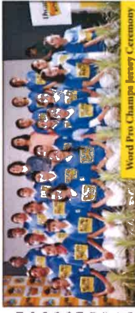
Word Pro Jersey Ceremony

The much-anticipated journey of Word Pro 2023 which started in the month of May, is getting closer to its stimulating Grand Finale scheduled on 1st September 2023. The Word Pro Jersey Ceremony was held at Delhi International School.