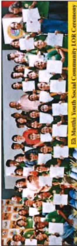
Ek Mutthi Youth Social Community LOR Ceremony

Dwarka City News "Gratitude sweetens even the smallest moments."