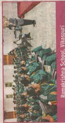
Ramakrishna School, Vileasuri