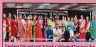
Vandana International School, Celebrated Teachers' Day