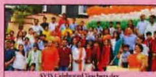
SVIS Celebrated Teachers' Day