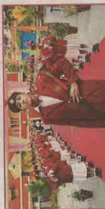
Presentation Convent Sr Sec School