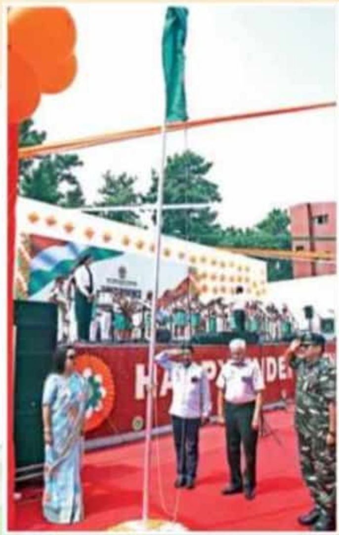
Celebrating the spirit of freedom and unity