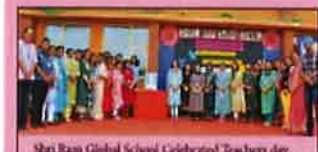
Shri Ram Global School Celebrated Teachers' Day