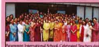
Paramount International School, Celebrated Teachers' Day