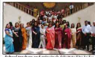
School teachers and principals felicitated by Indraprastha School Sahodaya and Delhi Sahodaya Schools Complex.