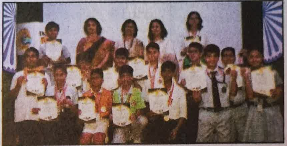
Word Pro Titans

All three champs were also awarded glittering Winner trophies, medals and certificates of excellence. 29 students of different schools scored full marks in the Word Pro Olympiad -Season 6 and were declared as WORD PRO TITANS.