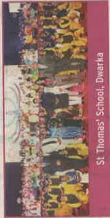
St Thomas' School, Dwarka

focus on the conceptual foundations of Accountancy. A highlight of the workshop was the advocacy for self-study and the importance of dedicated revision routines. The workshop went beyond theoretical discourse, providing students with invaluable insights.