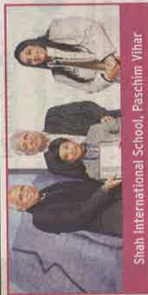
Shah International School, Paschim Vihar