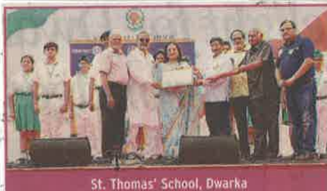
St. Thomas' School, Dwarka