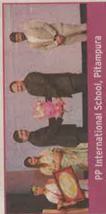
PP International School, Pitampura