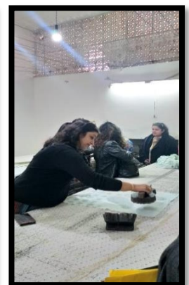
Printing with metal blocks