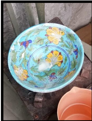
Unglazed Blue pottery