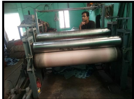
Industrial press machine for smoothening fabrics