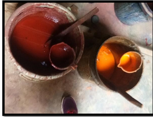
Vegetable printing dyes