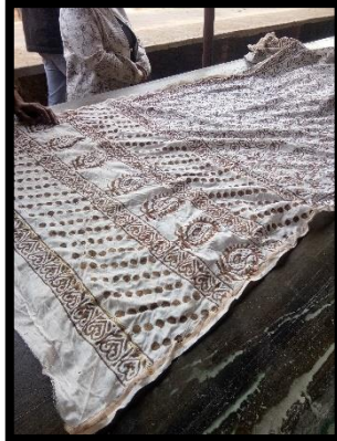
Textiles printed in Dabu printing technique