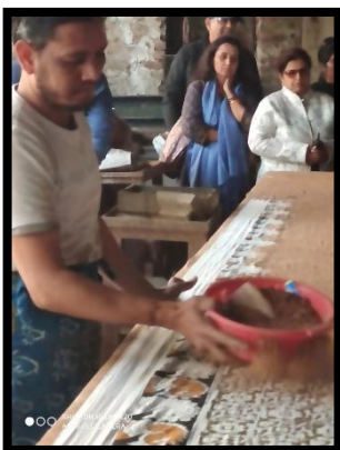
Dabu printed fabric