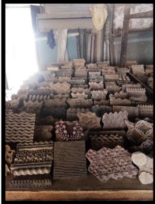
Dabu printing blocks