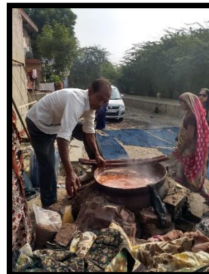
Preparation of dyes