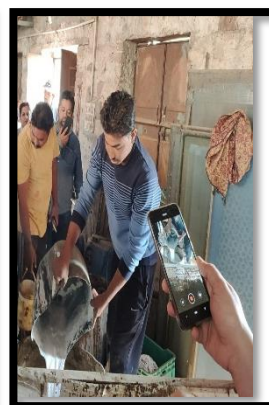
Preparation of mixture for Dabu print