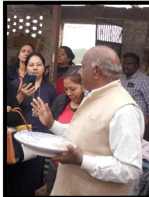
Artisan giving a brief about the history and origin of Blue pottery