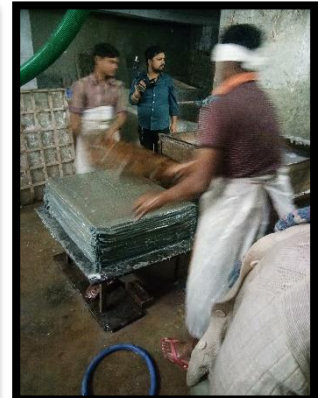
Paper being created out of paper pulp