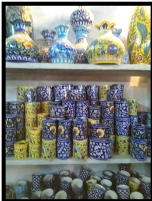
Finished blue pottery goods