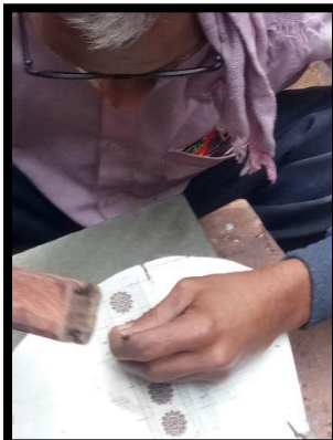
Blocks being traced and carved by Sangner karigars