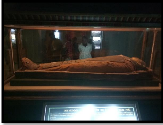
Mummy of an Egyptian lady at Albert Hall museum