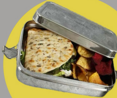
A small snack!