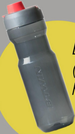
Bottle (Stay hydrated)