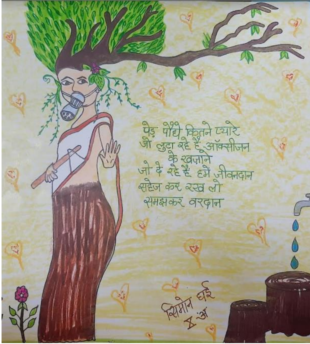
By Seemone Ghai