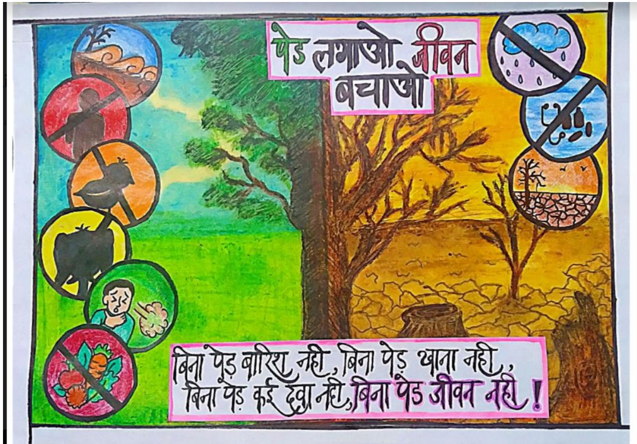
By Angelina Prem